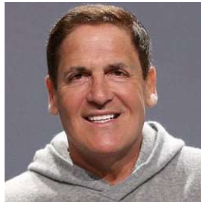
Rank: 13 Mark Cuban