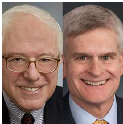
Rank: 34 Bernie Sanders and Dr. Bill Cassidy