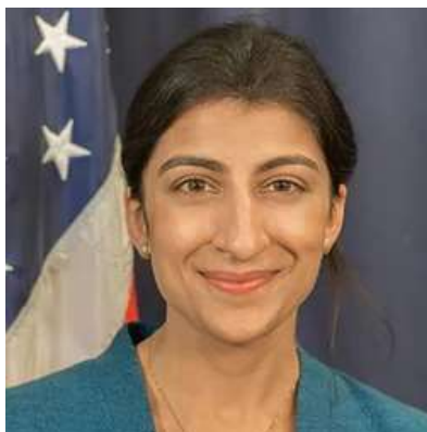
Rank: 5 Lina Khan