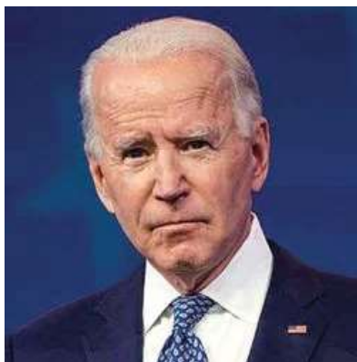
Rank: 7 Joe Biden