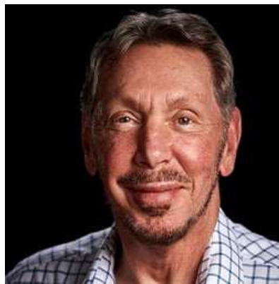
Rank: 35 Larry Ellison

Center for Medicare & Medicaid Innovation