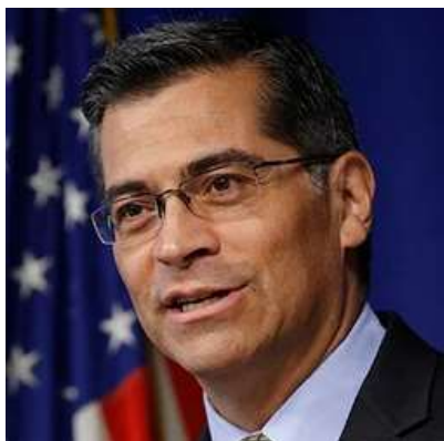
Rank: 8 Xavier Becerra